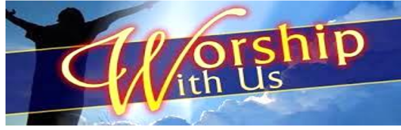
SUNDAY MORNING WORSHIP SERVICE 10:30AM SUNDAY EVENING PRAYER SERVICE 6:00 - 7:00PM