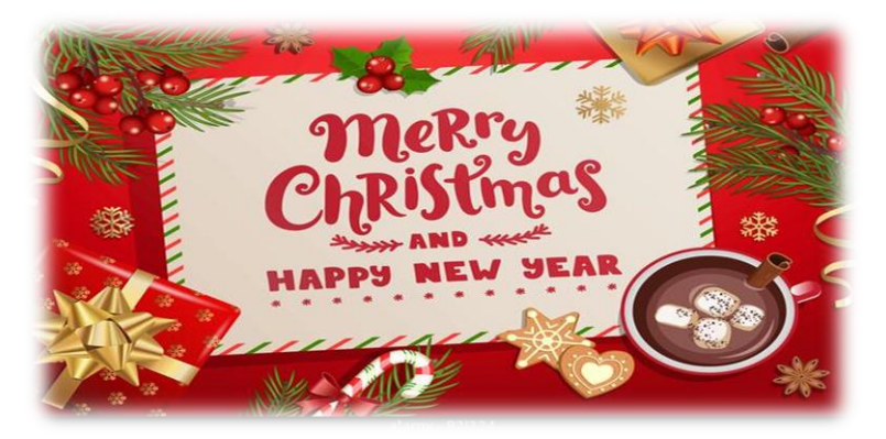
December 26, 2022 through January 3, 2023 the Church Office will be closed

If you would like to order Poinsettias in memory or honor of a loved one, we will include the information in our Christmas Eve Worship Bulletin. Please pick up an order form from the banister in the Narthex. Orders need to be turned in to the Secretary's Office no later than December 11<sup>th</sup> Thank You!